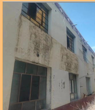
Before the renovation

The construction of the elementary school in GABU (Jianzha district) was financed by the foundation in 2009. Due to the extreme differences in temperature and humidity in the region between the very dry, cold winter and the very hot, humid summer, the school building was increasingly suffering. Unfortunately, the local government was not in a position to finance the renovation of the dilapidated building and therefore asked the Foundation for help. The Board of Trustees finally agreed to a sensibly reduced budget of CHF 18,300. After an impressive final spurt by the construction company, lessons were able to resume at the start of the new school year at the beginning of September.