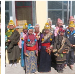
Scholarship awarded in Huanquhu school